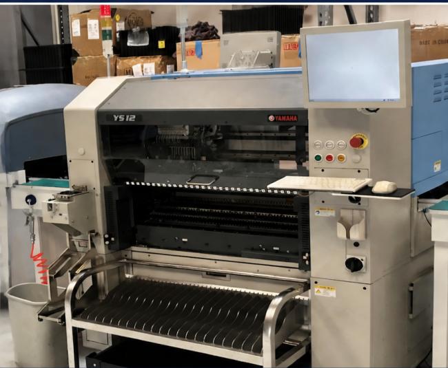
Yamaha YS12 SMT Pick-and-Place Machine