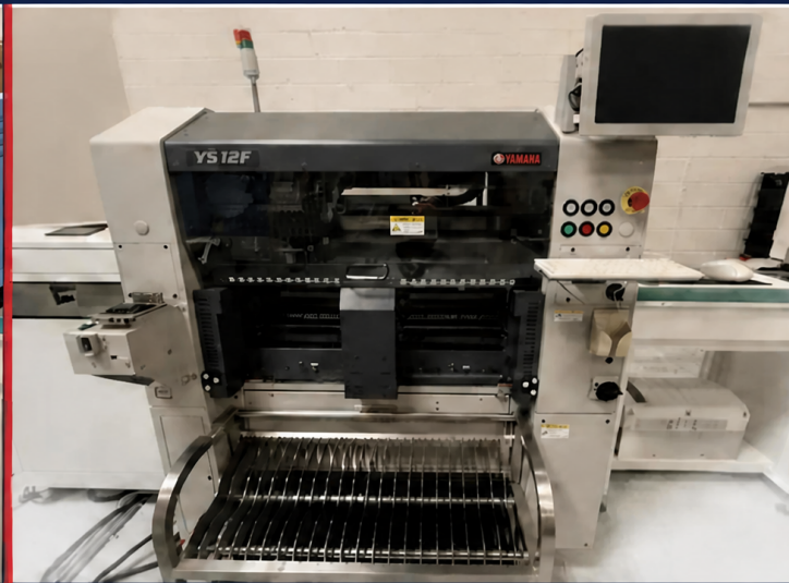
Yamaha YS12F SMT Pick-and-Place Machine