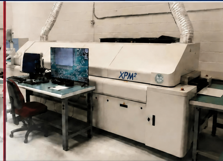
XPM2 Reflow Oven Industrial Tunnel Reflow System